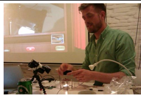
Generate electricity from candle's heat.

There were free popcorns and Heinekens for the open lecture. The two speakers works in DELTA, a Danish company. Their presentation was informative, but that was not the most interesting part. Besides the usual PowerPoint presentation, they brought in functioning lab prototypes and did a demo right in front of us. It was like they had nothing to hide from the audience,