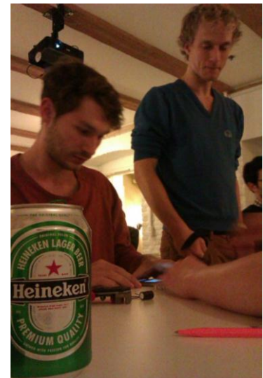
Students learning with the kits.