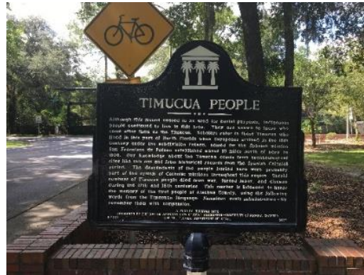
Timucua Burial Mound Marker at the University of Florida*

Gainesville, located in north-central Florida, is a city with a perfect mix of history and natural beauty. Invaded by European colonists in the 19 th century, the Timucua people originally inhabited the area. After its official establishment in 1853, Gainesville became the seat of Alachua County, flourishing as a small town with a rich agricultural foundation.